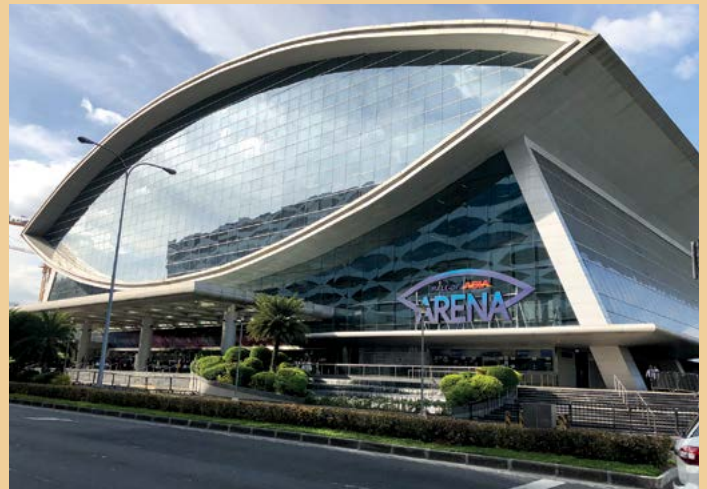
Left: I was invited to preach to our pastors and church members in Manila. Right: The Mall of Asia Arena is the biggest and best hall in the Philippines.

When you send your gift, please request my DVD, "The Game Changers — Jesus." When you request your FREE DVD, please quote this number: AGC1817-1818.*